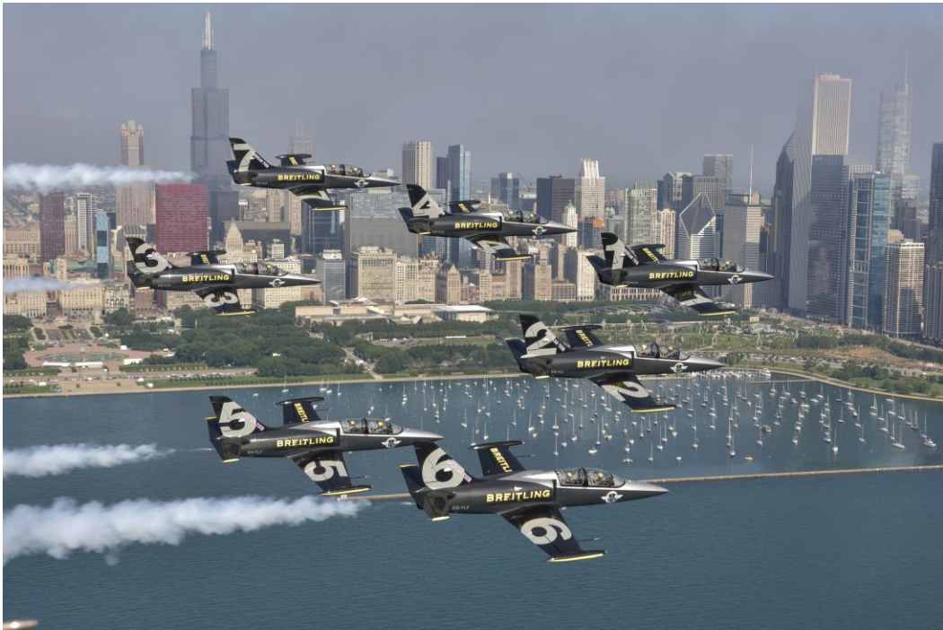
Breitling Jet Team flies over Chicago