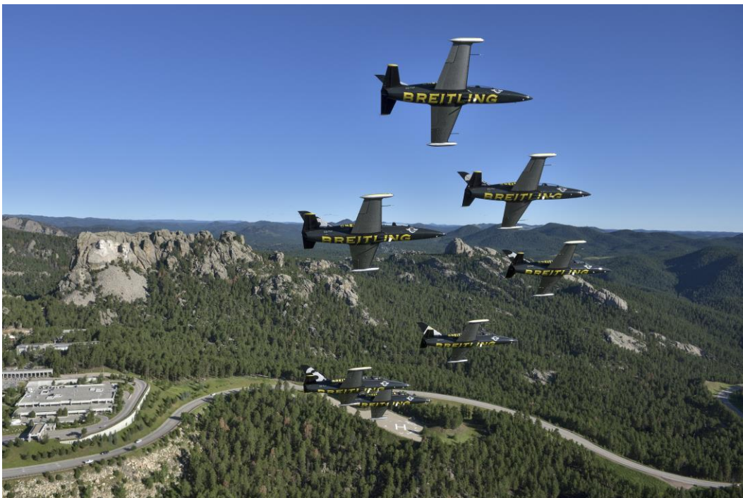
Breitling Jet Team flies over Mount Rushmore National Memorial