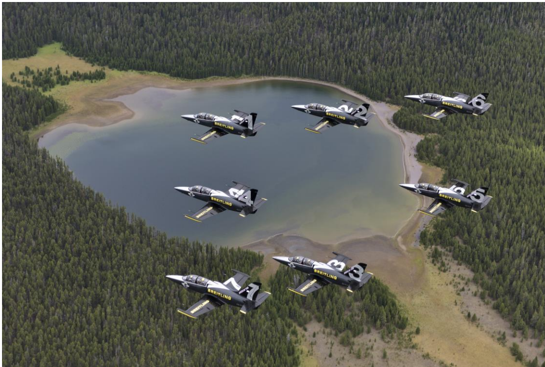
Breitling Jet Team flies over Yellowstone National Park