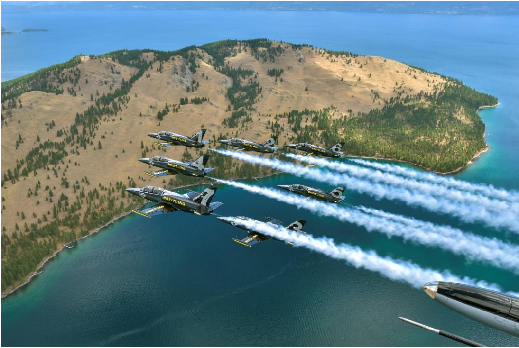
Breitling Jet Team flies over Flathead Lake