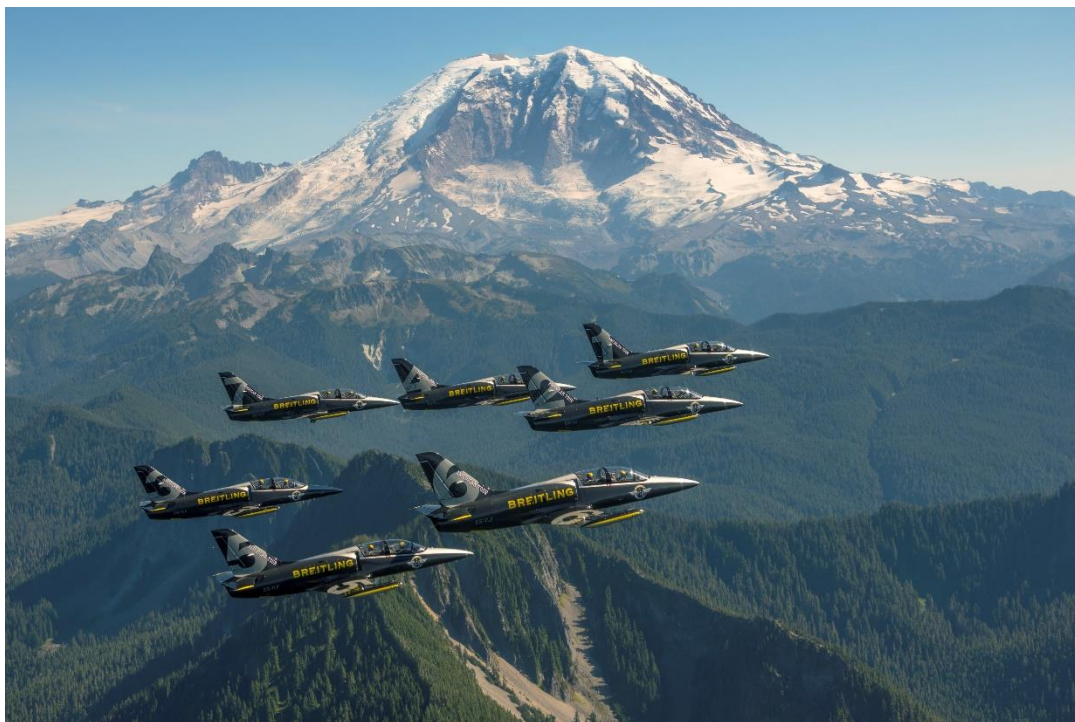
Breitling Jet Team flies over Mt. Rainier